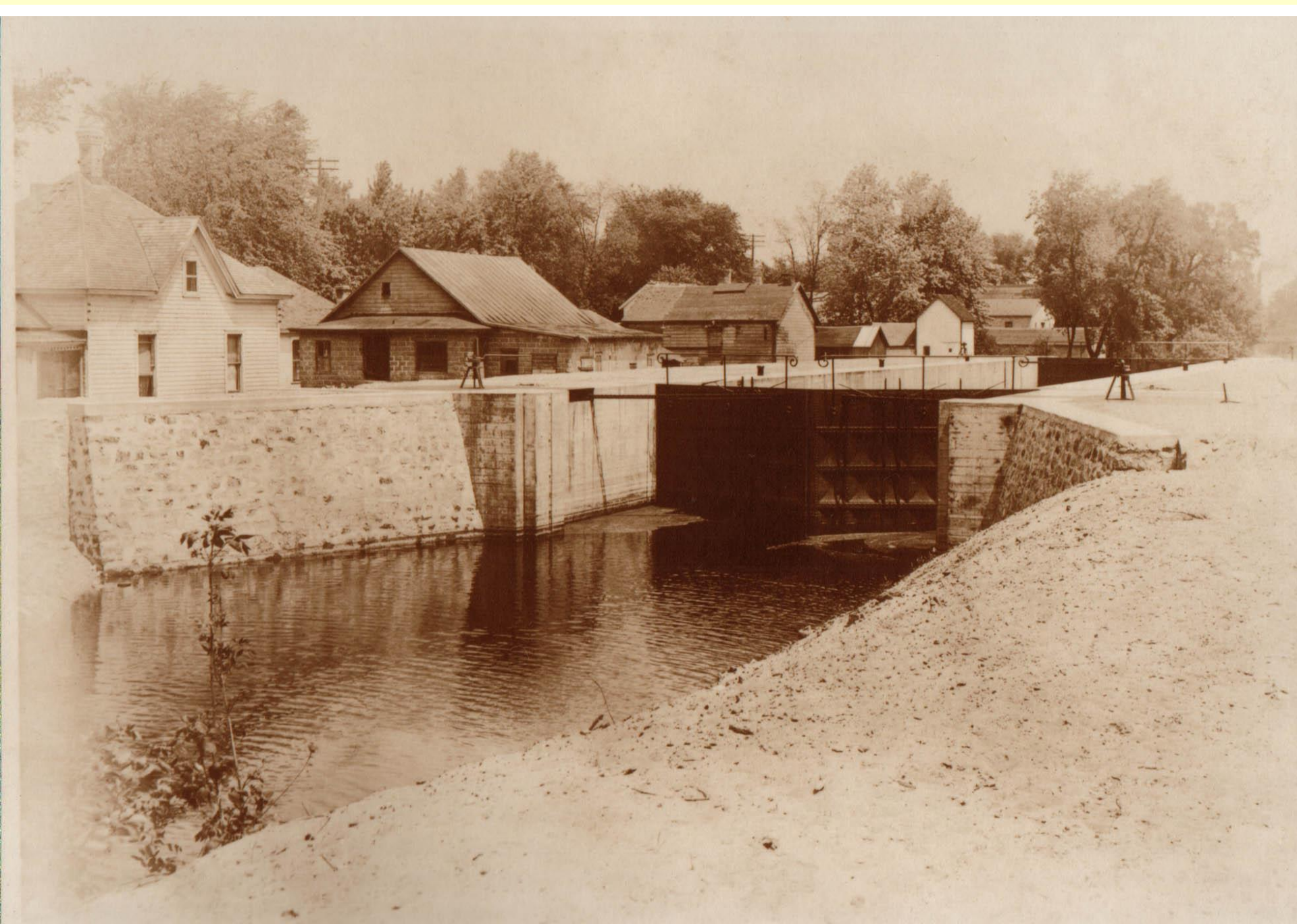
Canal, Portage Lock from West, Houses in Background