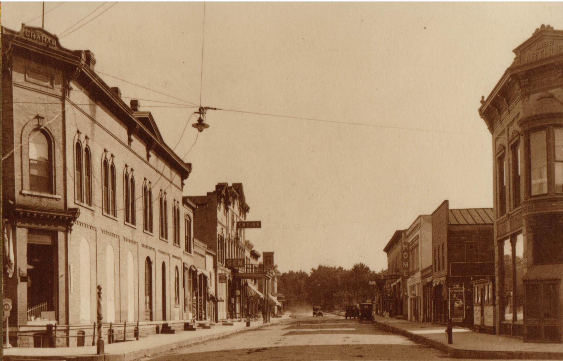
Cook St. East from Dewitt, Portage, Wis. 76131.