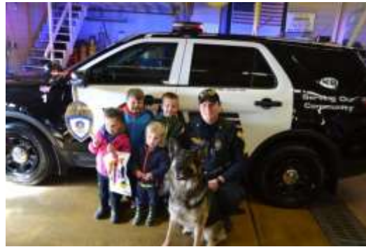
Ben & Ares are always a hit with kids