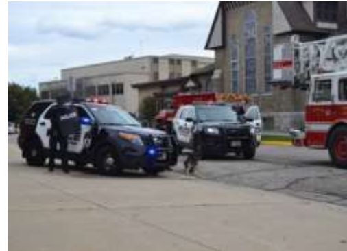
Suspect vehicle is stopped