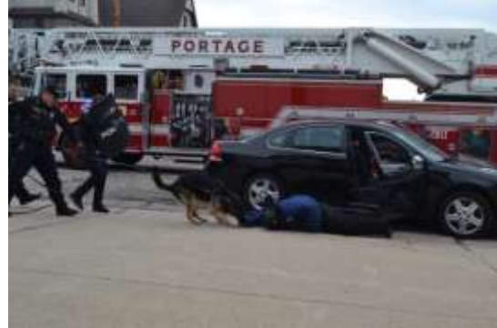
Arrest team approaches Suspect #2