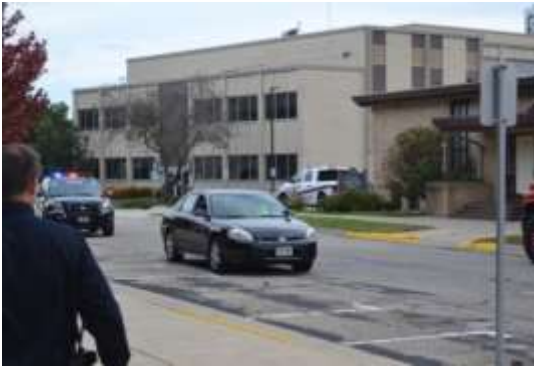
High risk traffic stop begins