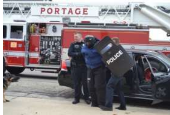
Suspect #2 patted down for weapons/taken into custody