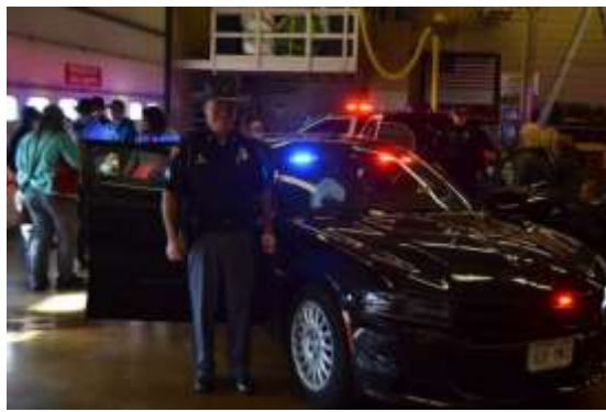
A Police Officer and a Crossing Guard!