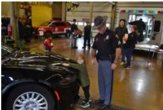
This little guy "assumes the position" as he's about to be arrested (by his dad!)