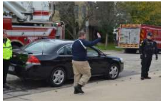
Cam waves to the onlookers showing he’s ok