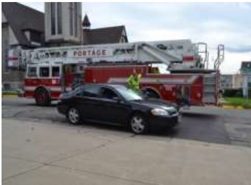
Kevin – suspect #1 - is cooperative & complies with orders