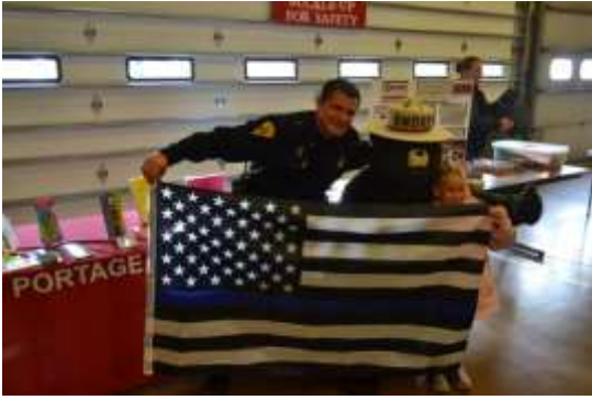
This little girl won the “blue line” flag