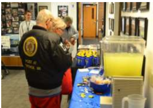
Citizens were treated to lemonade and other goodies