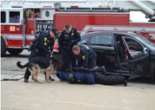
Suspect #2 safely detained