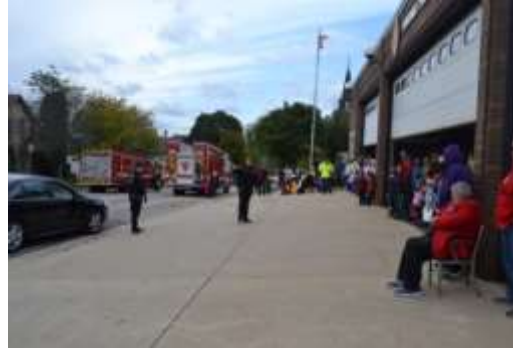
Despite the bad weather, there was a nice turn-out